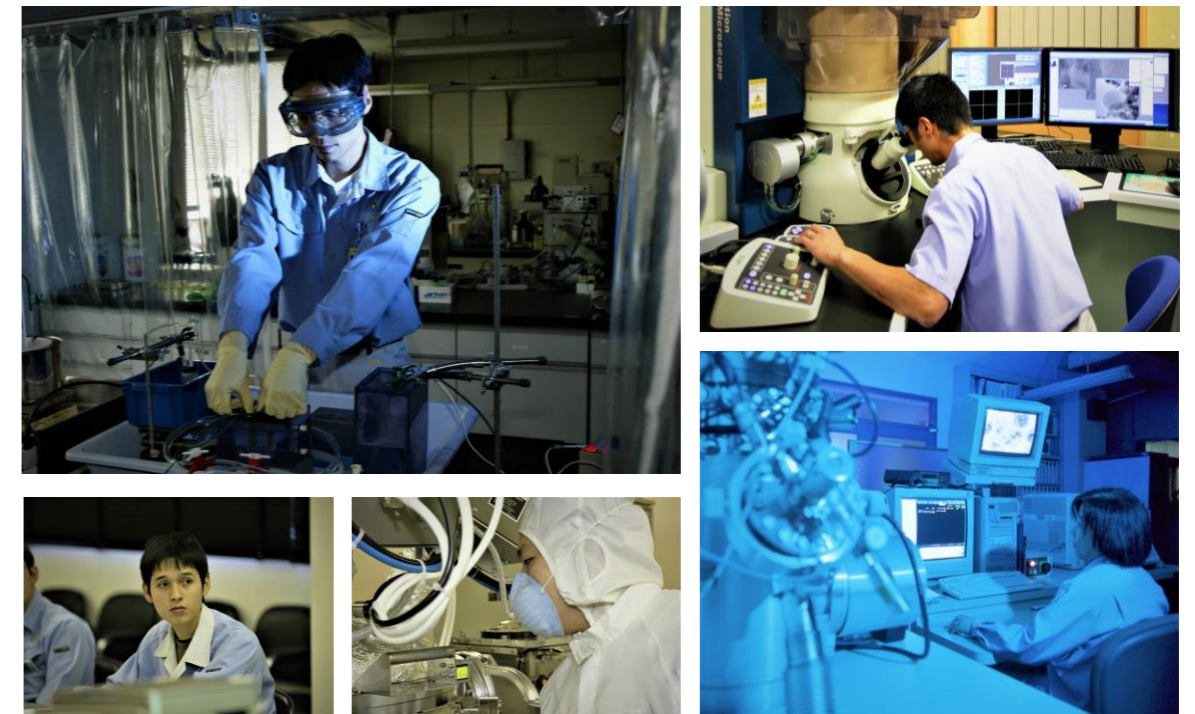
Business Creation Sector R&D Center