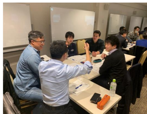
Unconscious Bias Training

Through career education, interviews, and other measures, we will consider both employees' wishes and the company's expectations to continue initiatives for supporting the growth of individuals to achieve their career vision. We will also improve the existing internal public recruitment system and consider measures that respect employees' right to choose their careers.